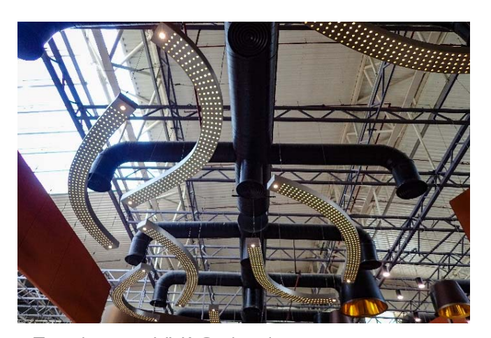
Food court HVAC ducting