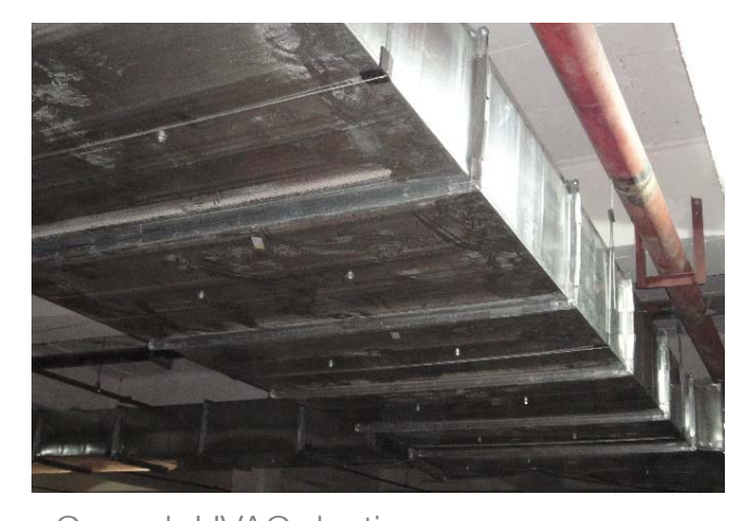
Carpark HVAC ducting

There were 3 main challenges for this project; (1) an aesthetically pleasing suspension solution was needed, (2) the products chosen needed to overcome height restrictions in the carpark, and (3) the installation needed to be quick to meet tight project timescales.