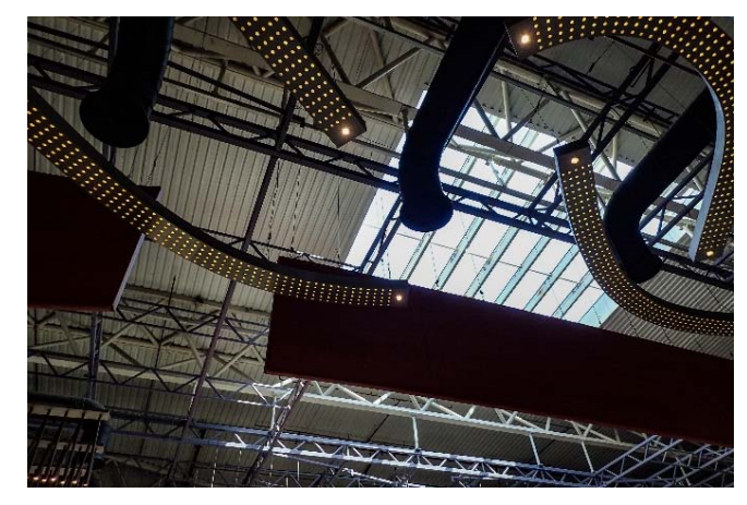
Food court lighting and raceways