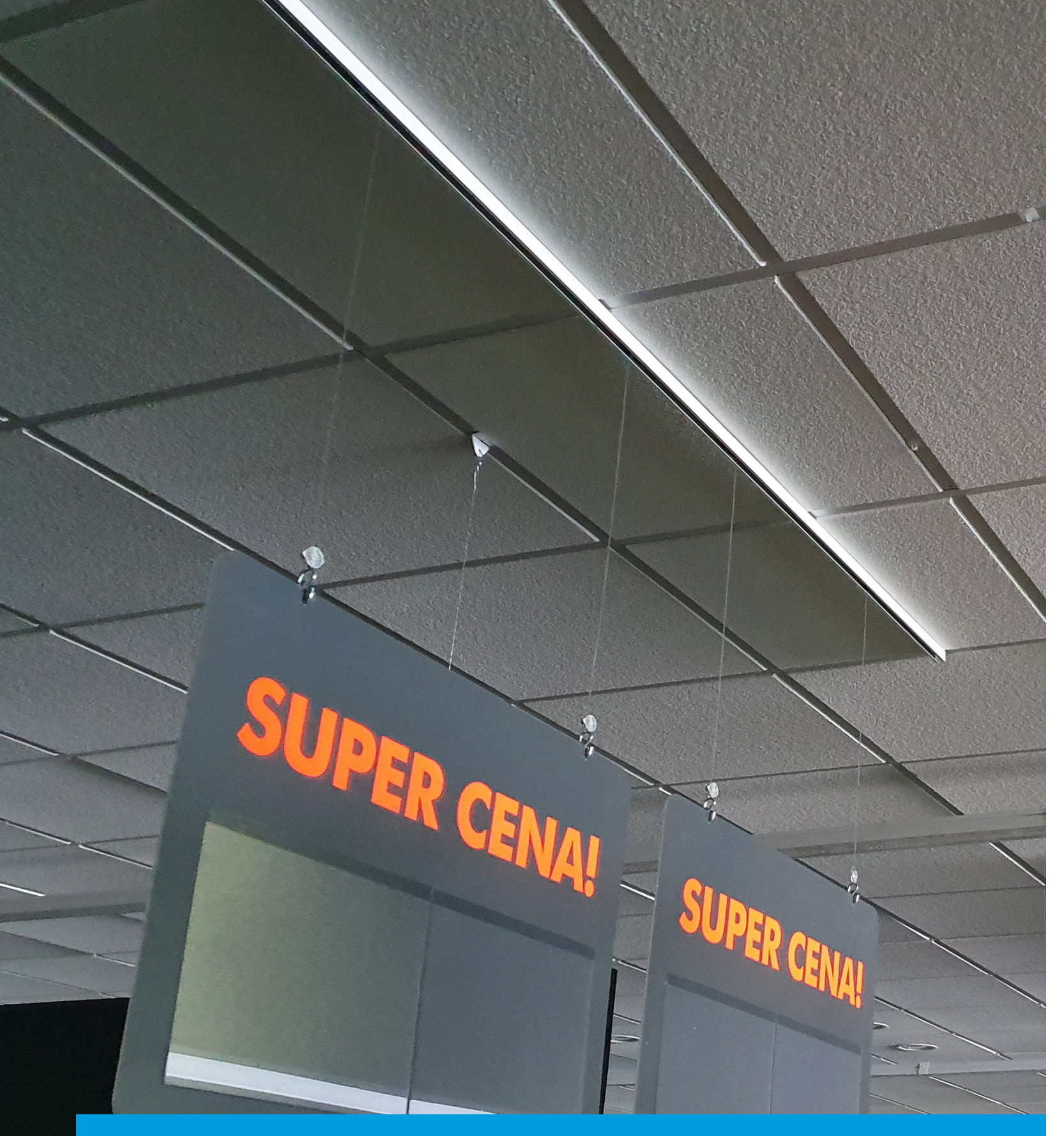
Gripple InvisiGrip™ offers a professional, visually discreet and easy to install solution for the suspension of retail signage, decorative displays, acoustic panels and lighting. It's the perfect choice for instances where aesthetics are important.