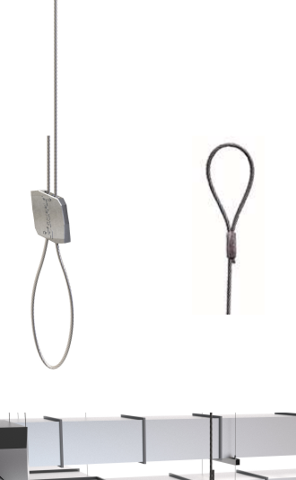
0.367 (kg CO<sub>2</sub>e)*

Embodied carbon result with 'mid-level TM65 calculation' method total: